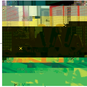
Star-shaped turning device