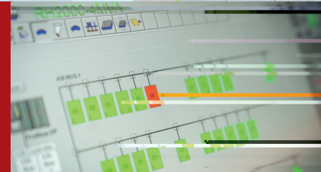
Quicker troubleshooting Detect and analyse the problem faster