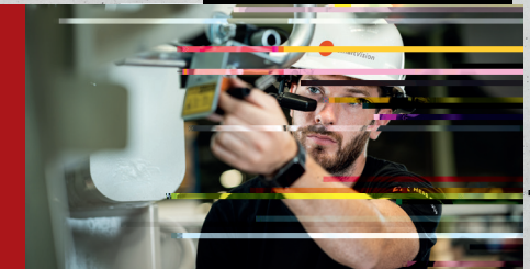
Handsfree Solution Smart ss data glasses