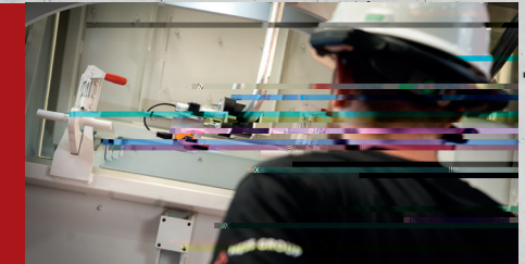
Remote Support Fast problem solving without the need for an on-site visit